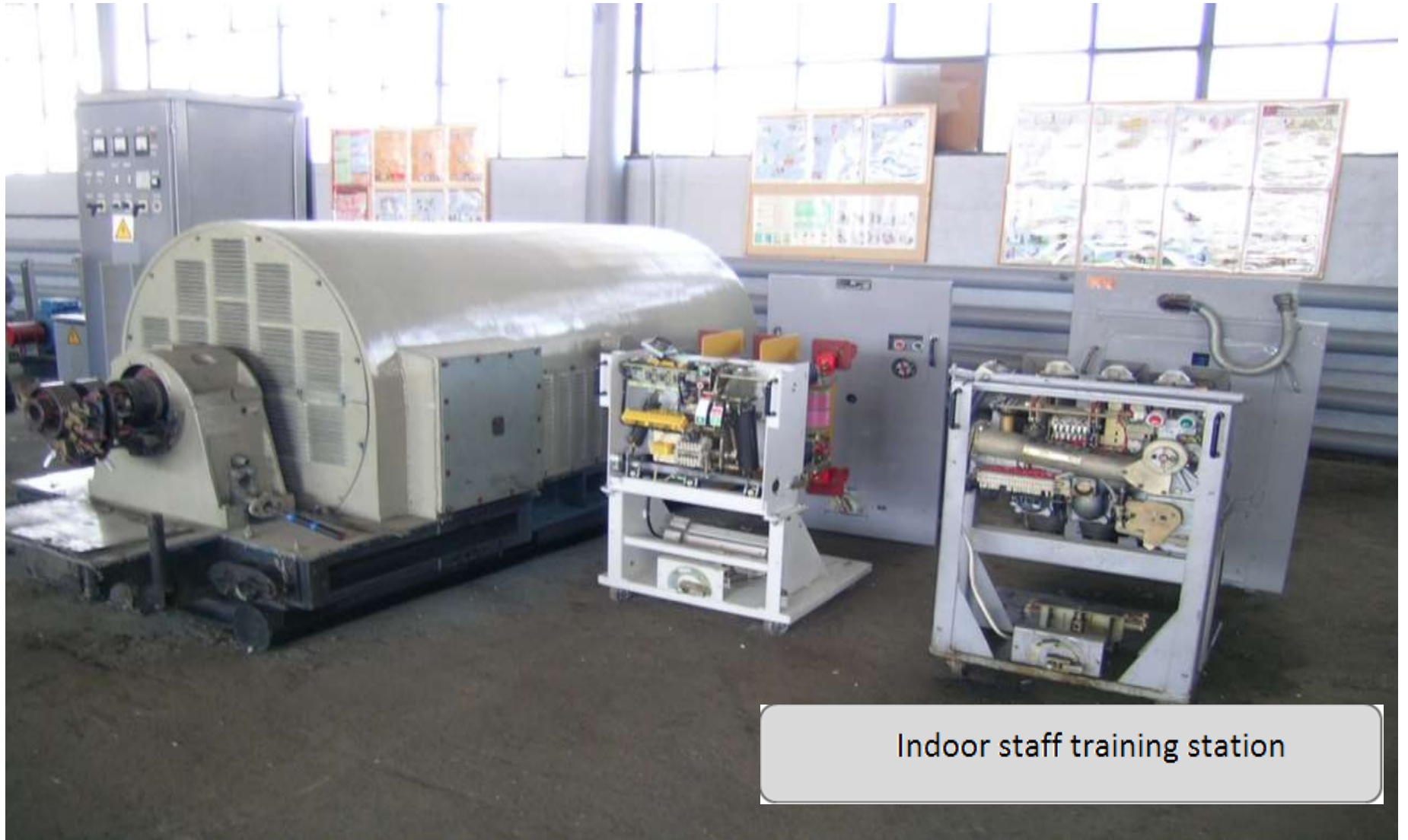
Indoor staff training station