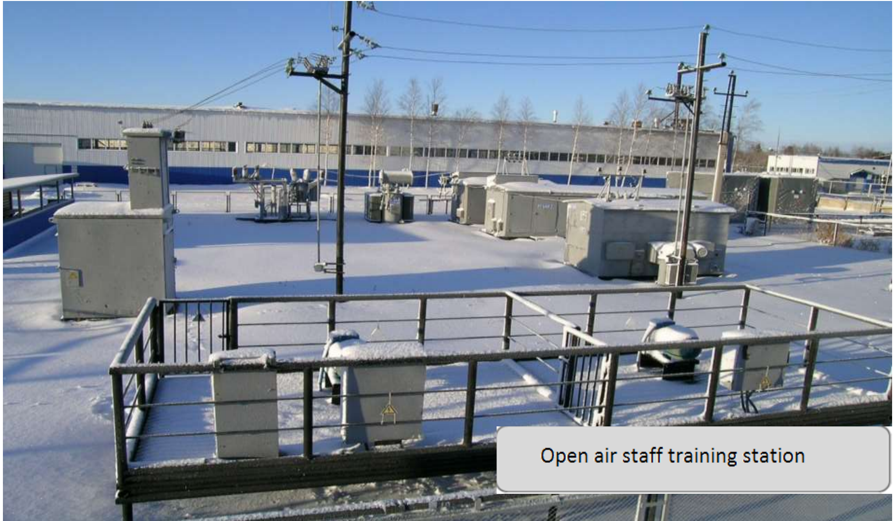
Open air staff training station